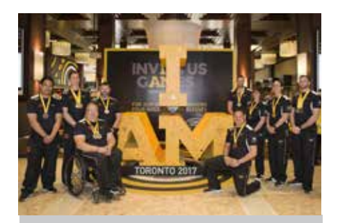
To find out more about the Commemorative Fund visit www.veteransaffairs.mil.nz/ commemorative-fund or give us a call.

"In the previous nine months we've provided over $43,000 in funding"