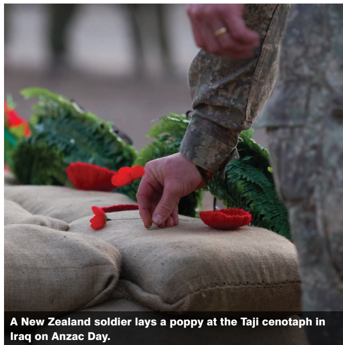
A New Zealand soldier lays a poppy at the Taji cenotaph in Iraq on Anzac Day.