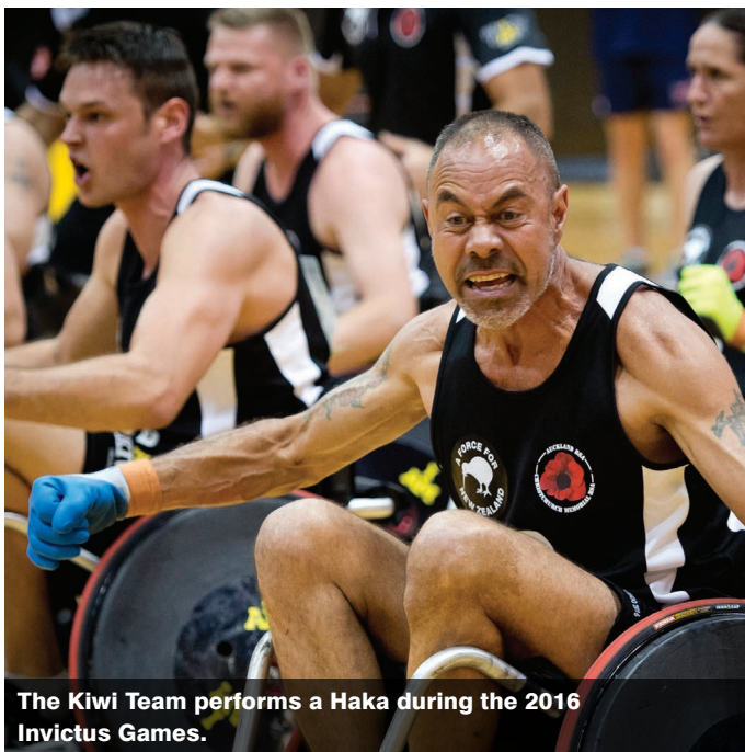
The Kiwi Team performs a Haka during the 2016 Invictus Games.