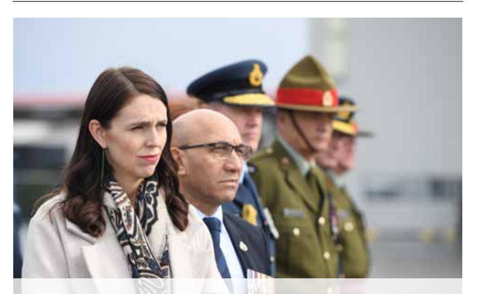
The Right Honourable Jacinda Ardern, Prime Minister of New Zealand and the Honourable Ron Mark, Minister for Veterans and Minister of Defence at the ramp ceremony for the return of our fallen from Malaysia and Singapore.

Ka maumahara tonu tātou ki a rātou We will remember them