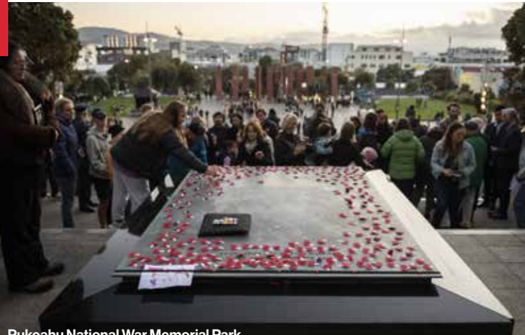
Pukeahu National War Memorial Park, Wellington