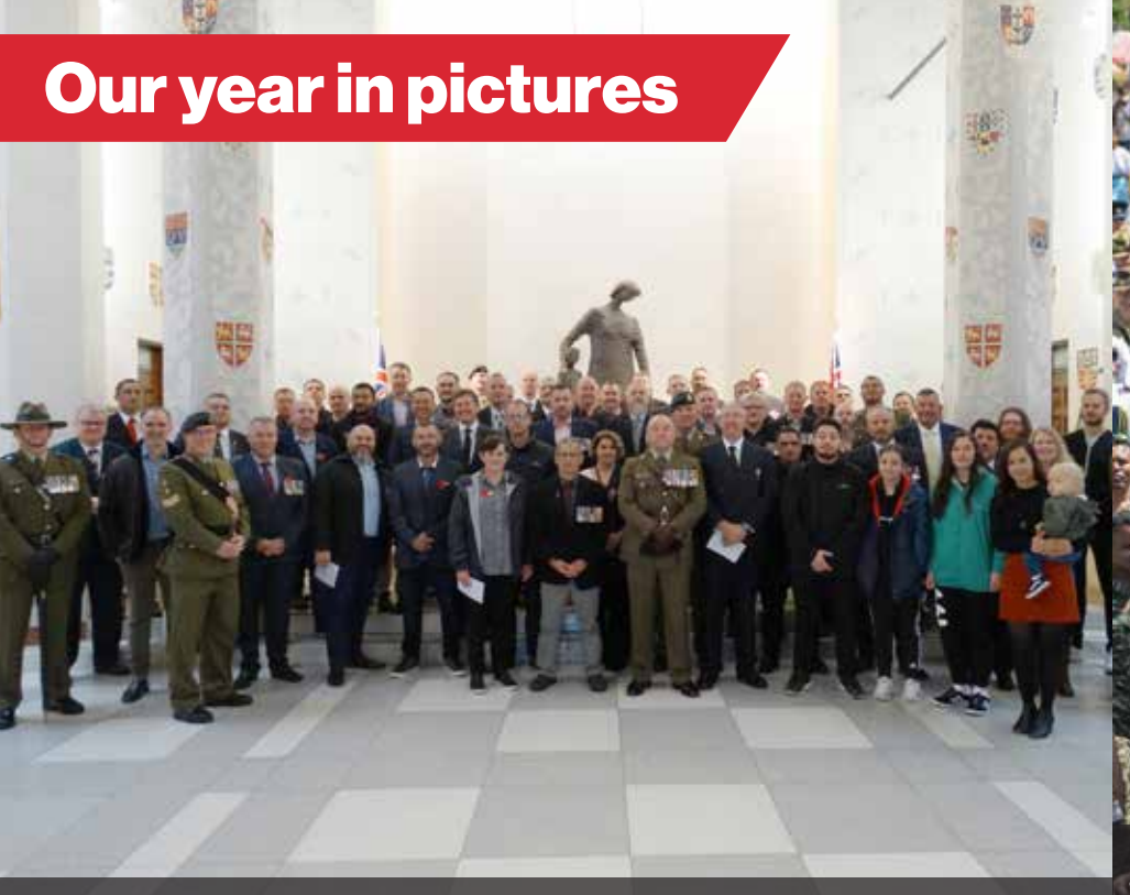
Operation RADIAN veterans in the Hall of Memories at Pukeahu National War Memorial, September 2019.