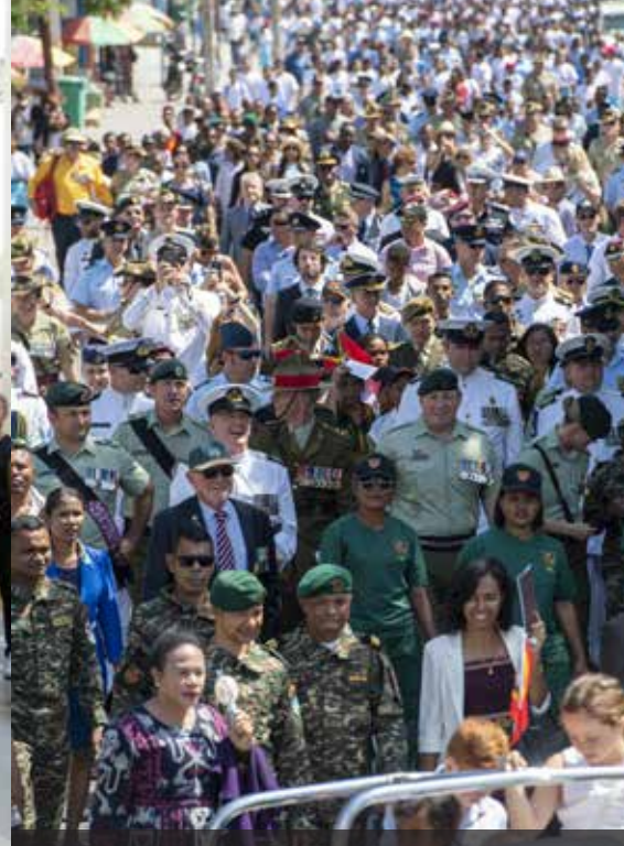
New Zealand INTERFET veterans in the 20th anniversary commemoration parade in Dili, Timor-Leste, September 2019.